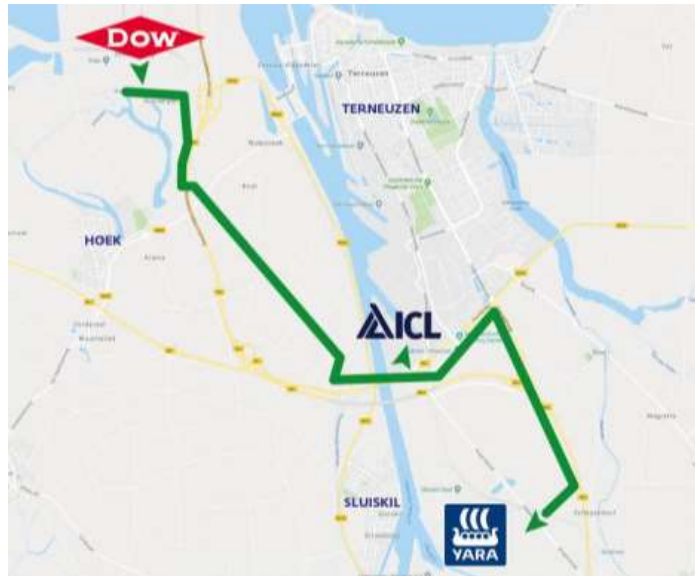
Figure 8: Gasunie's hydrogen transmission pipeline

On 30 June 2021 the Netherlands Ministry of Economic Affairs and Climate Policy announced that it will commission Gasunie to develop the national infrastructure for the transport of hydrogen. 10 The project, with an estimated investment of €1.5 billion, is scheduled for completion in 2027. Most importantly, the new national hydrogen network will consist of 85% reused natural gas pipelines, resulting in costs four times lower than if entirely new pipelines were laid.