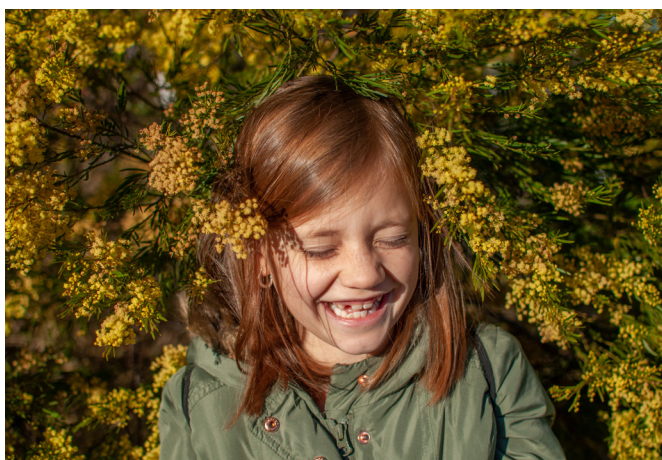
Lead Images