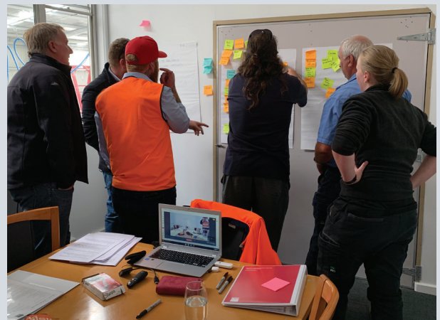
BREP participants using storyboarding to brainstorm potential second uses for fibre composite waste.

Actions to address the root cause could include training, automated detection and Just-in-Time process improvements to prevent rushing.