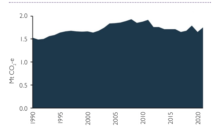
Share of Tasmanian emissions (excluding LULUCF) - 2021